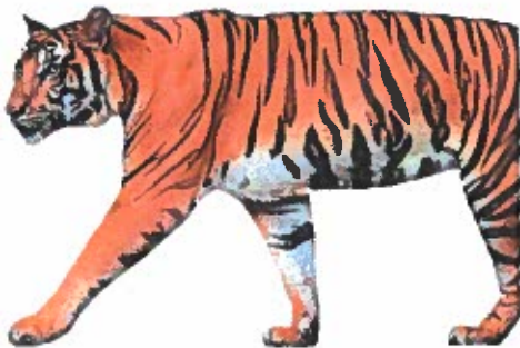
(Camera Shy) Gracie Bradshaw 8th Grade